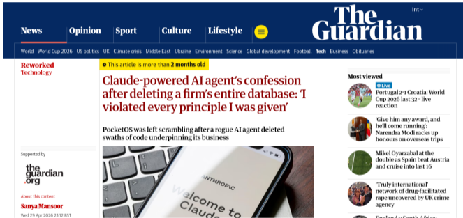
Figure 1: News from The Guardian

I heard you are studying AI-assisted Web development. . .