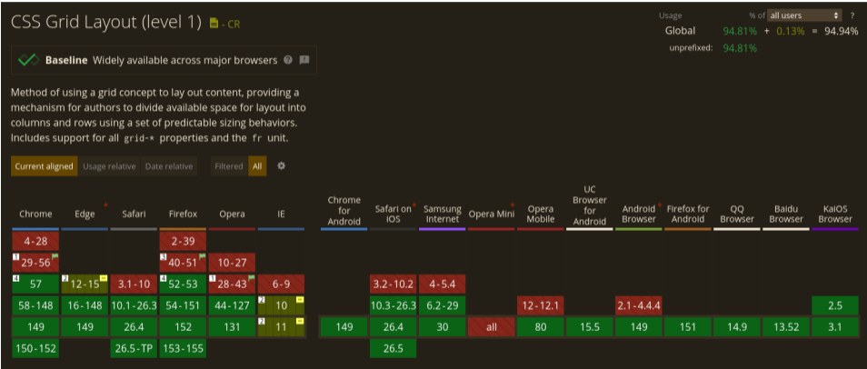
Figure 3: Feature support across browsers (caniuse.com)